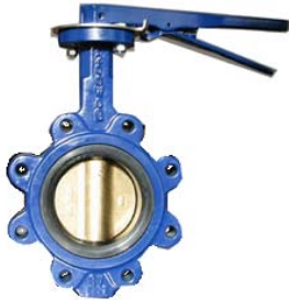
Figure: BL-1000 Series